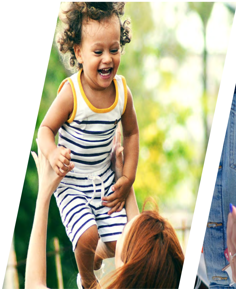
the future's leaders ...