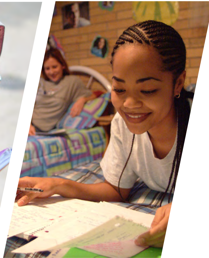
... and tomorrow's graduates