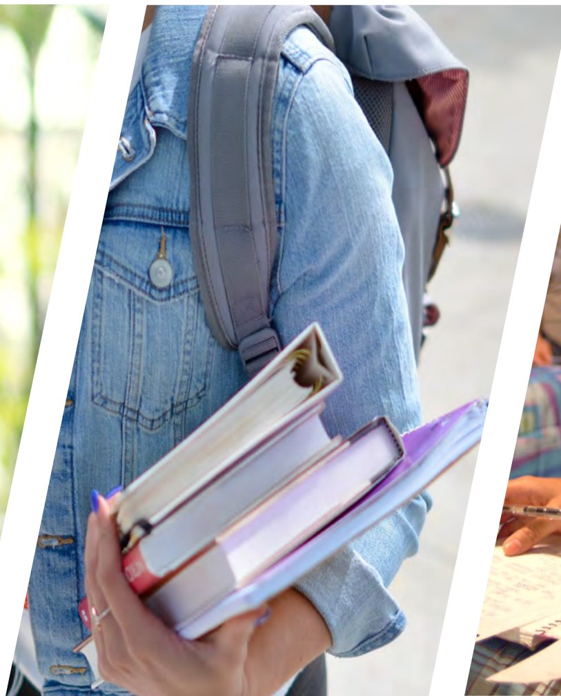
... are today's students ...